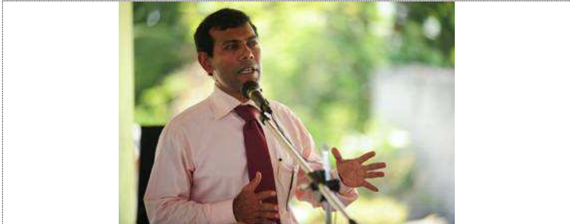
President of the Maldives