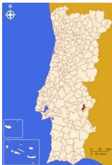
Figure 1. Santas Bat Location

The power station of Santas Bat will be located in Borba municipality in Portugal as shown in the photo below and will have an estimated installed capacity of 124 MVA/225MWh (hereinafter the “ Project ”).