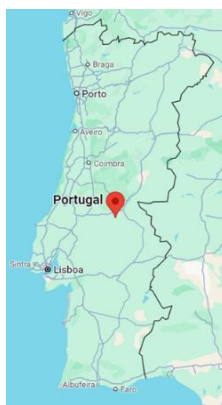
Figure 2: Amarzena Location

The power station of AMARZENA will be located in Gavião municipality in Alentejo in Portugal as shown in the photo below. The project will have an estimated installed capacity of 20 MW / 80MWh (hereinafter the " Project ").